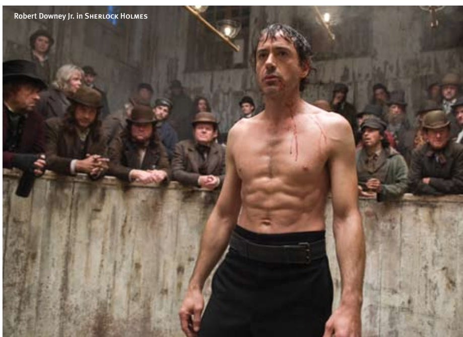
Robert Downey Jr. in SHERLOCK HOLMES