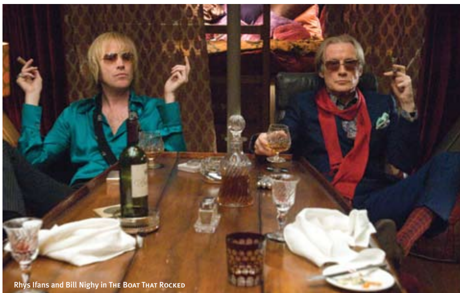
Rhys Ifans and Bill Nighy in THE BOAT THAT ROCKED

may not want to change anything, as the lighting works well for you, but on other occasions it can be very frustrating, as for the benefit of the stills photographer the lighting could be enhanced. This is a frustration one has to live with when filming in the studio. Working outside with daylight of course gives the set photographer a great deal more creative freedom.”