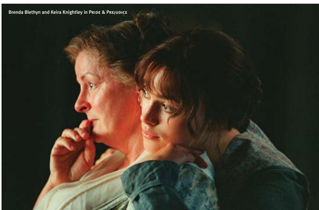
Brenda Blethyn and Keira Knightley in PRIDE & PREJUDICE